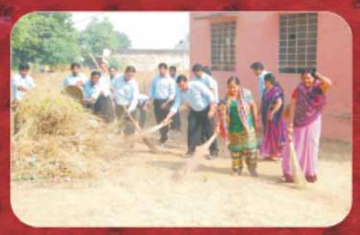
Swachh Bharat Abhiyan at Dhodsar Villege