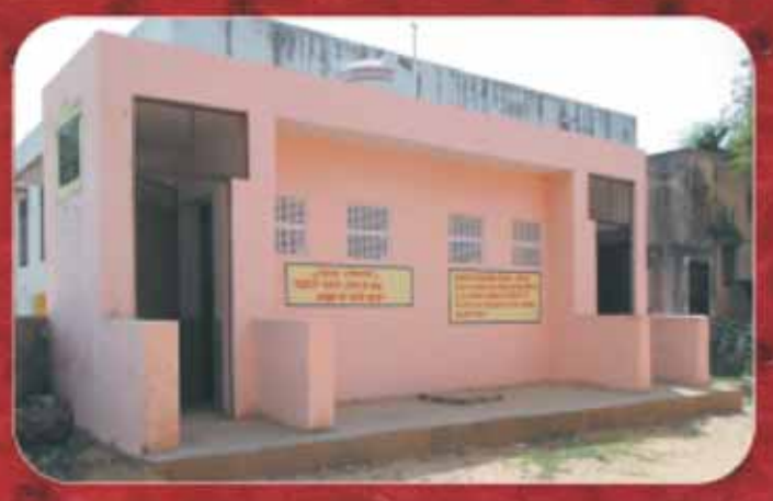
Constructed new toilet( Apni Azadi) at Girls Upper primary school Dhodsar