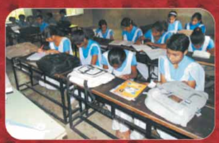
Distribution of Furniture for Students at Senior Secondary School Dhodsar